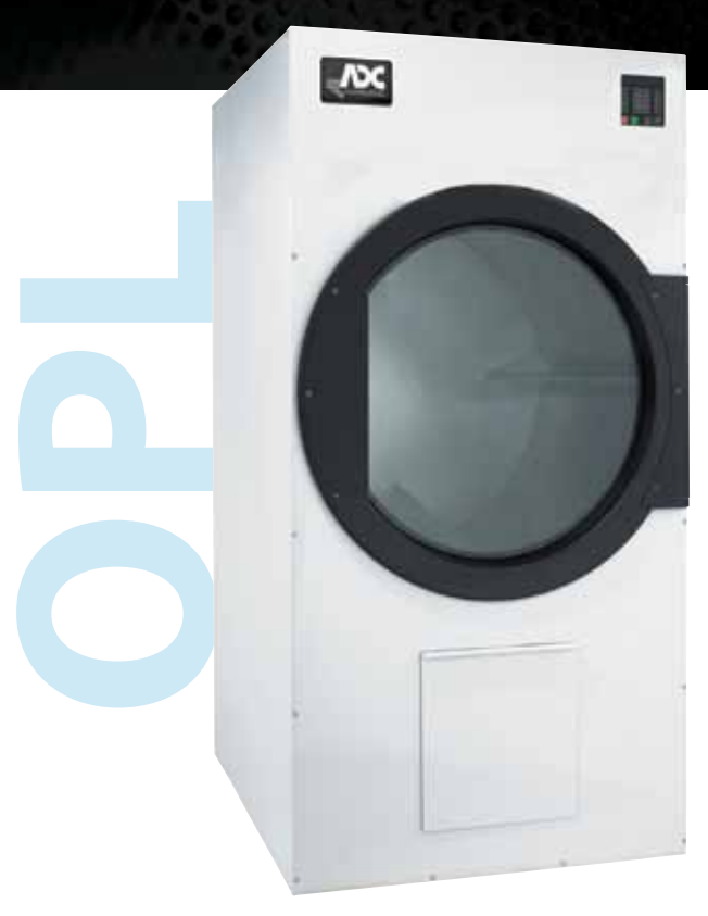
AD-115 OPL Dryer