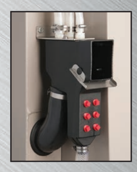
Safe chemical injection