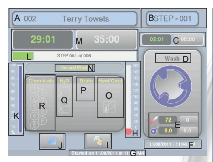
To download the MilTouch PC programmer, visit milnor.com/miltouchprogrammer