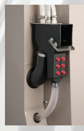
30022 V8Z chemical inlet shown

Chemicals are injected in the rear of the machine (unlike certain brands where chemicals are injected near the front of the machine at eyelevel). Chemicals are diluted and flushed into the sump of the washer-extractor so that raw chemical does not come in direct contact with the linen or the stainless steel. The metal lip prevents corrosion, which prolongs the life of your Milnor washer-extractor.