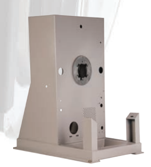
30022 V8Z frame shown

Milnor frames are designed to prevent concentration of stress in one spot and all structural components are tied together for optimum stress dispersion. This proven structural integrity means your machines will last longer.