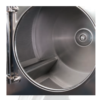
36026 cylinder shown

Milnor's tall rib construction and precise cylinder speeds combine to provide excellent MAF – Mechanical Action Factor – ensuring goods get clean the first time, reducing time-consuming and costly rewashes.