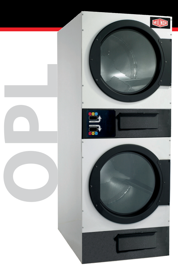
M333 OPL Stack Dryer